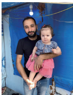
Interviewee's husband and daughter

"On hot summer days while I was pregnant, I used to pass out frequently from the heat. In the winter, our tent would get muddy and turn into a pond from all the collected rainwater. I finally feel I am a human being not neglected by the world. I won't have to worry about the weather affecting our lives and endangering my daughters."